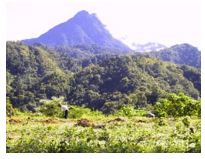
Wuzhishan mountain and Nature Reserve

right of which was transferred to the company. Secondly, the indigenous resource management norms showed signs of change. The Li people had long made very strict distinction between what was "planted/grown" and what "grew naturally". While the planted crops were used only by the people who planted them, the plants that grew naturally were used by any people, irrespective of their residential place or ethnicity. Medicinal herbs, edible plants, wild animals, honey, and wild tea leaves, for example, have been utilized not only by the Shuiman people but also by the neighbouring Li villagers, Miao ethnic minority people, or Han people. No spatially defined commons under collective resource management existed. The people who have such magnanimous resource management norms were good guides for the visitors who wished to make money from wild resources. Traders of precious butterflies, giant stag beetles (Genus Docus), orchids, or medicinal herbs, arrived at Shuiman village and exploited such animals or plants, despite the fact that collection in the reserve is prohibited by law. The Shuiman people did not complain at first, but some of them later started to claim that such economically valuable resources around Shuiman village should not be exploited freely by the people from outside. The indigenous norms for resource management may change toward "tight" ones as the people understand their economic value in the world market.