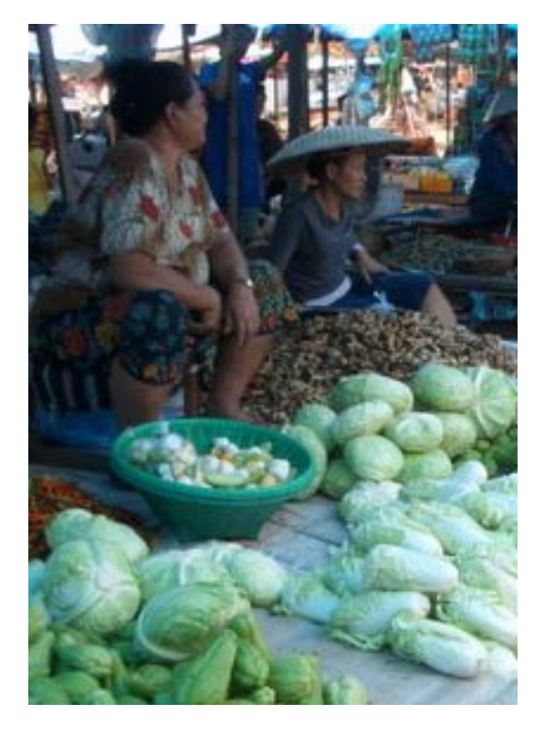
UNITED NATIONS UNIVERSITY