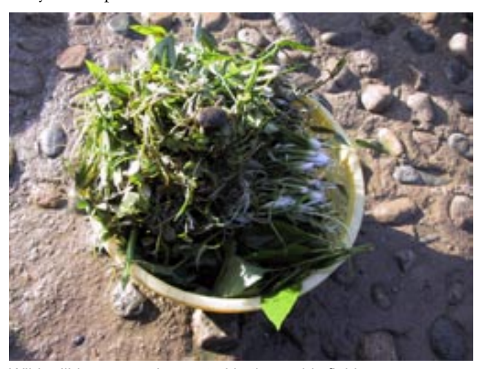
Wild edible grasses harvested in the paddy fields

In Shuiman village, side dishes other than purchased ones included wild plants/animals, and vegetables grown in kitchen gardens adjacent to the villages. Sweet potatoes, cassava, and maize were also planted in mixture with cash crops. It is worth noting that various wild grasses were frequently collected in or around paddy fields. Of 38 species of grasses found in an irrigation channel, 25 were edible. Of the 29 species in a ridge between rice fields, 5 were edible. Of 19 species grown in paddy fields, 8 were edible. Also 13 species were used as medicinal herbs for daily health problems.